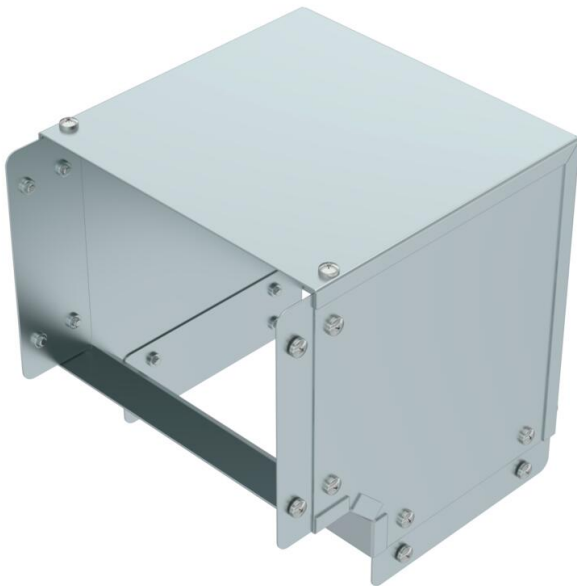
Single Compartment 90 Degree External Cover Bend, Pre-Galvanised Steel to suit Cable Trunking 200mm x 150mm

Trench Part No. SA8690E | OBO Item No. 7907198